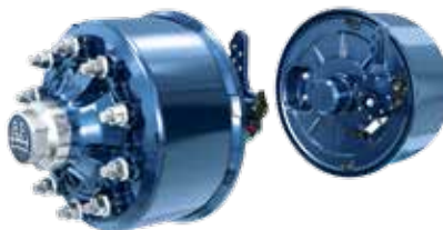
Axle stub for double-deckers and box trailer vehicles