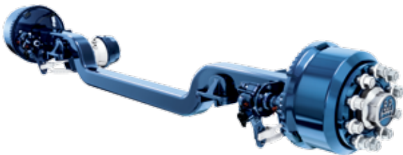
Cranked axles for transportation of cars and boats