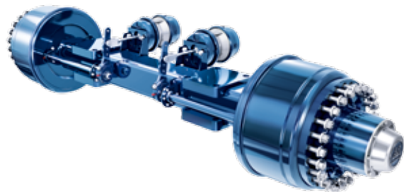
Heavy duty axles for the heaviest transport goods